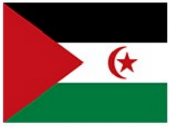
Sawari Arab DR*