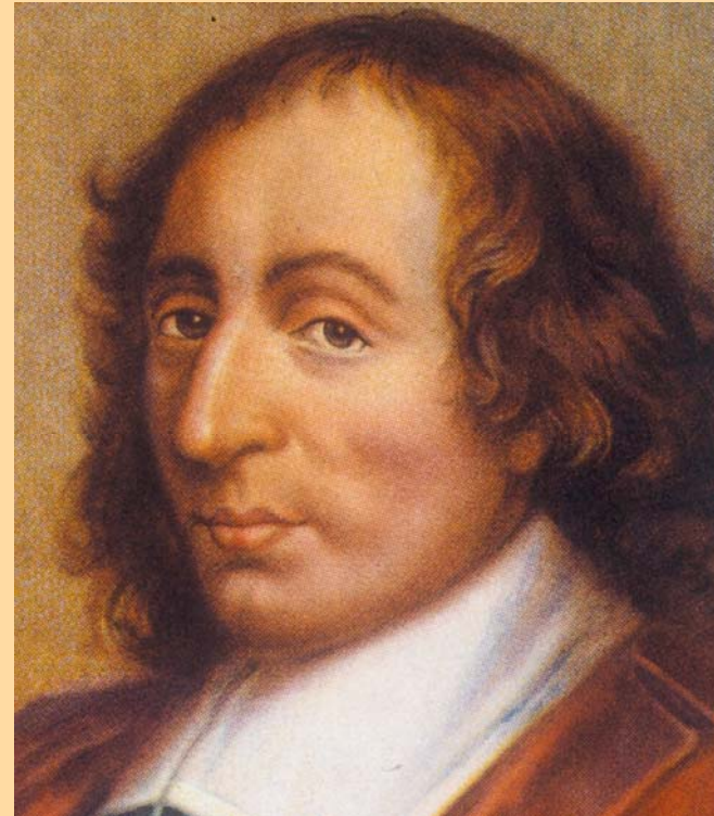
Blaise Pascal 1623–1662