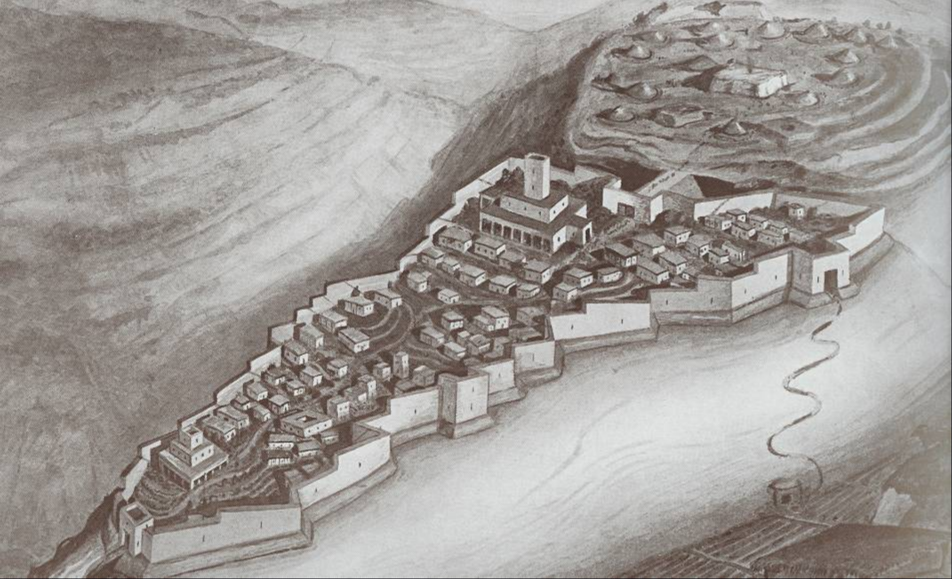
Jerusalem Time King David