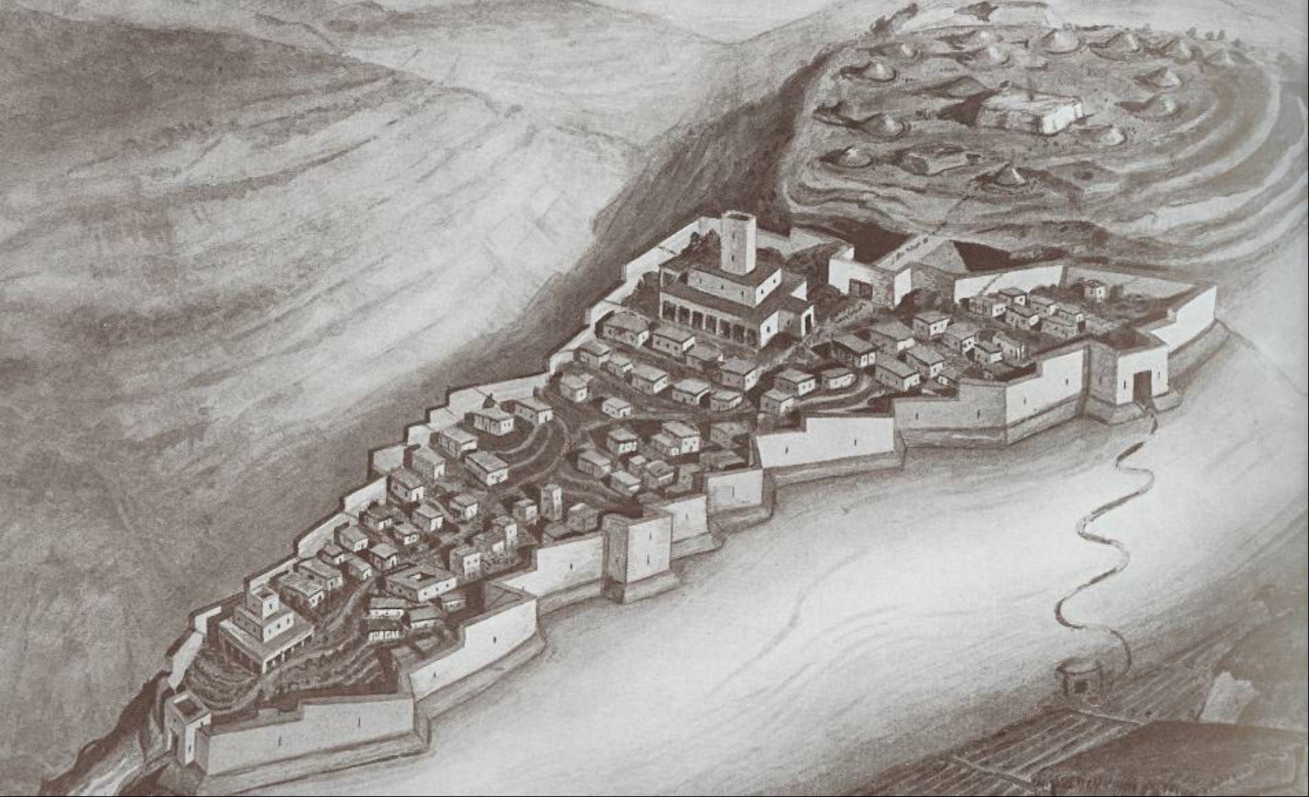
Jerusalem at the Time of King David