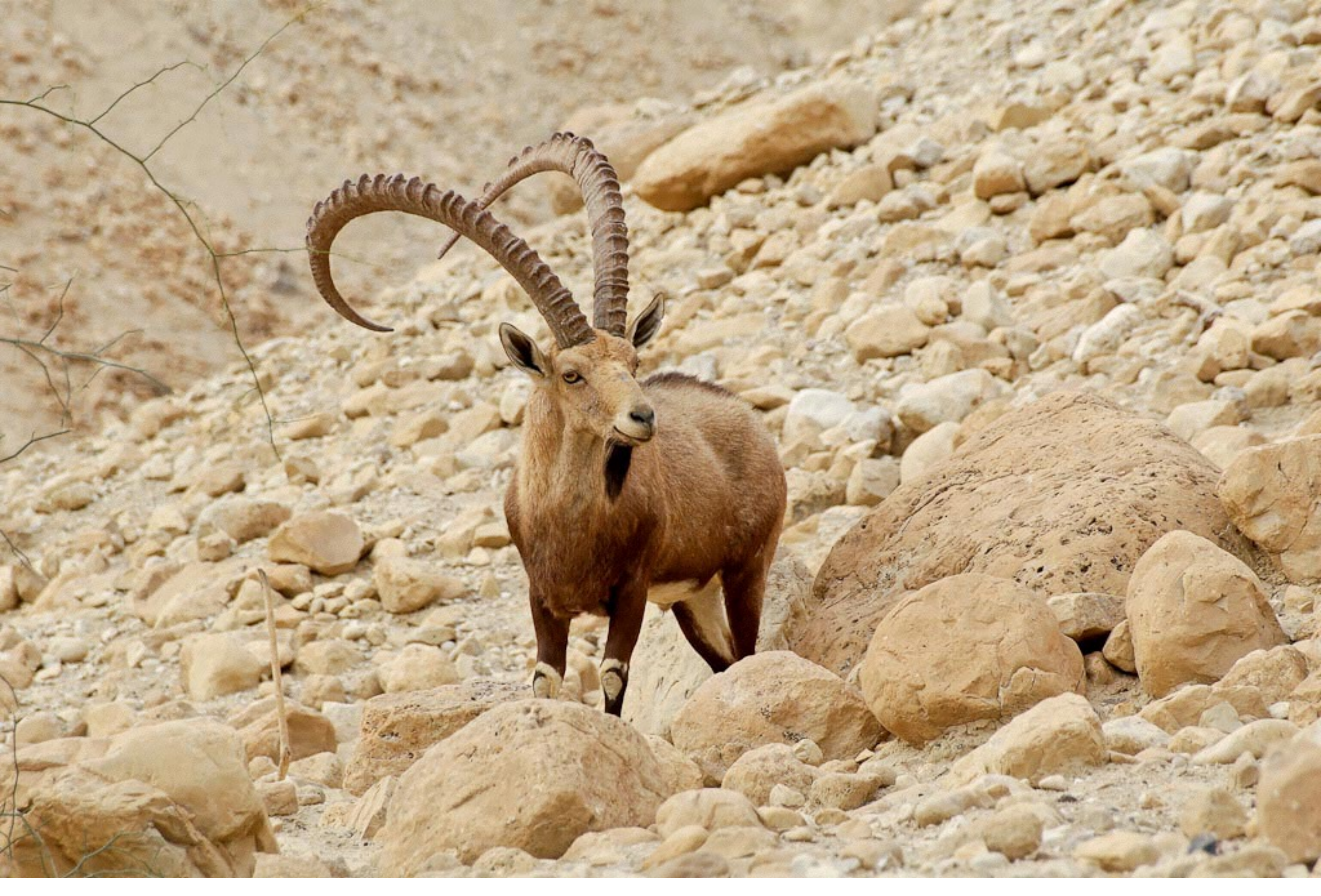
Ibex at En Gedi