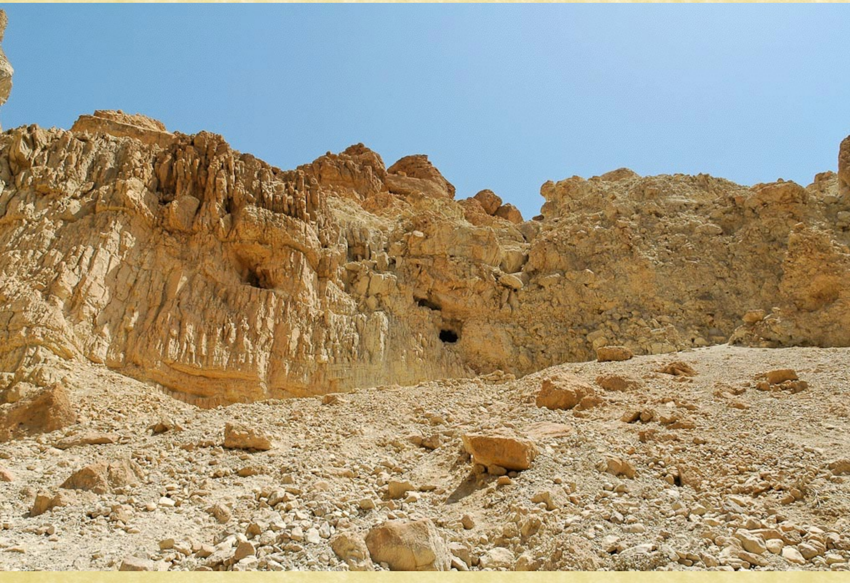
En Gedi Nahal David caves