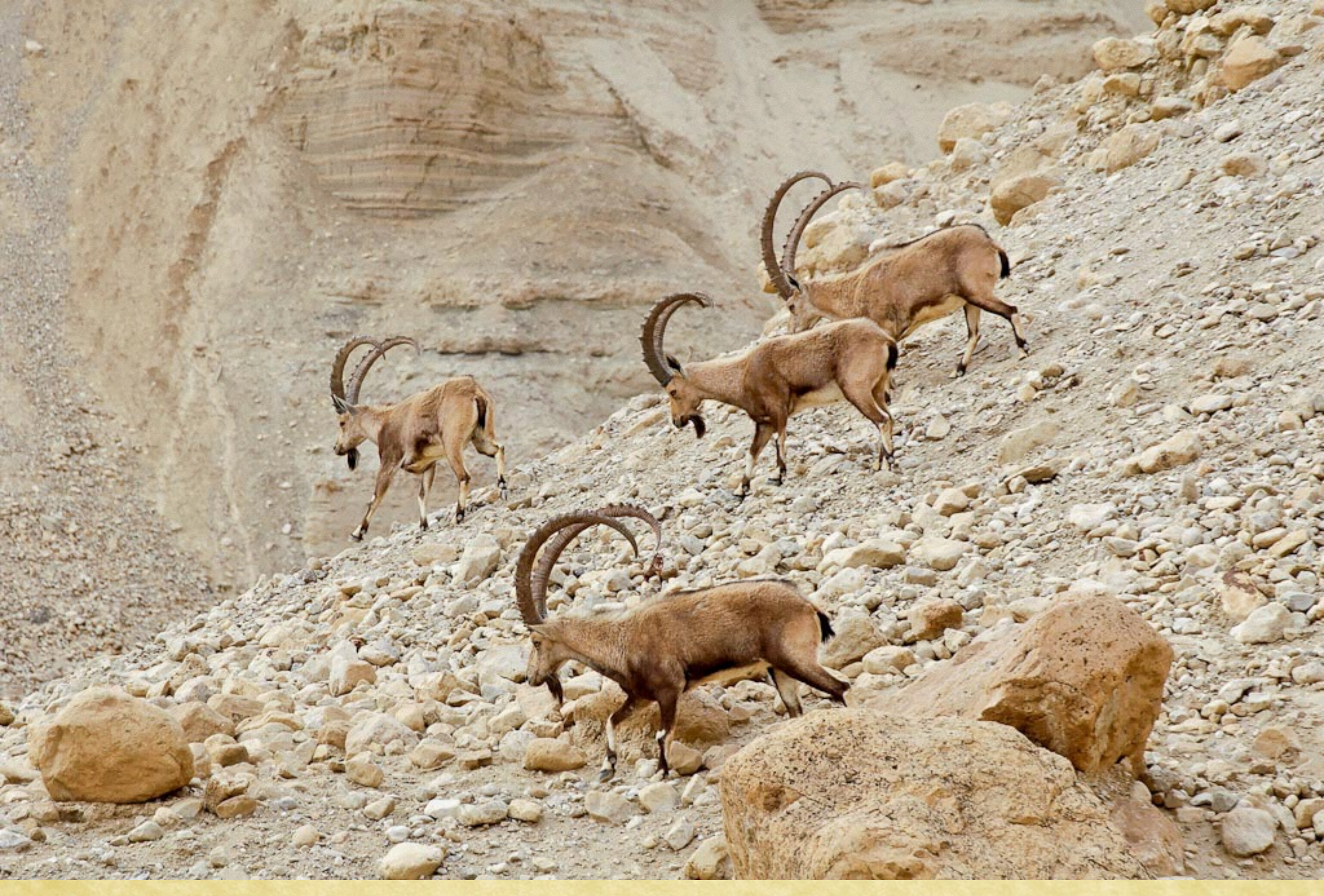
Ibex male herd at En Gedi